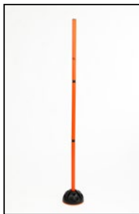
Insert pole into Training Set Stand