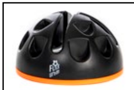
Training Set Stand